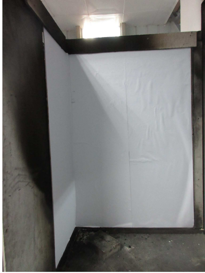
Before Test (EN 13823)