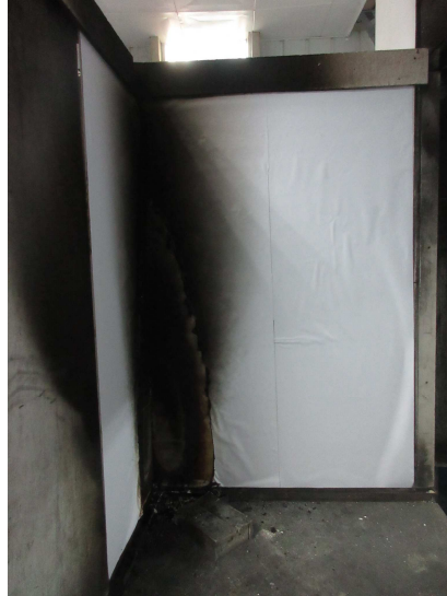
After Test (EN 13823)

SGS authenticate the photos on original report only